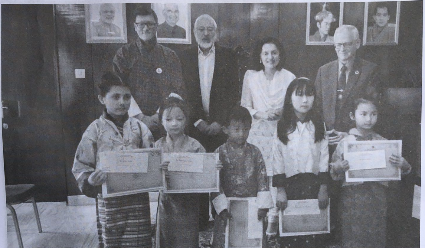
Five children who have taken part in the 'yoga for children' received certificates and cash prizes.

The theme for this year's International Yoga Day is "Yoga for Health-Yoga at Home"