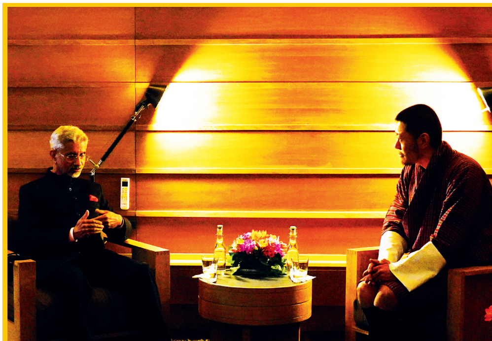
29 April 2022: His Majesty The King granted an Audience to the Foreign Minister of India, who is on a two day visit to Bhutan.