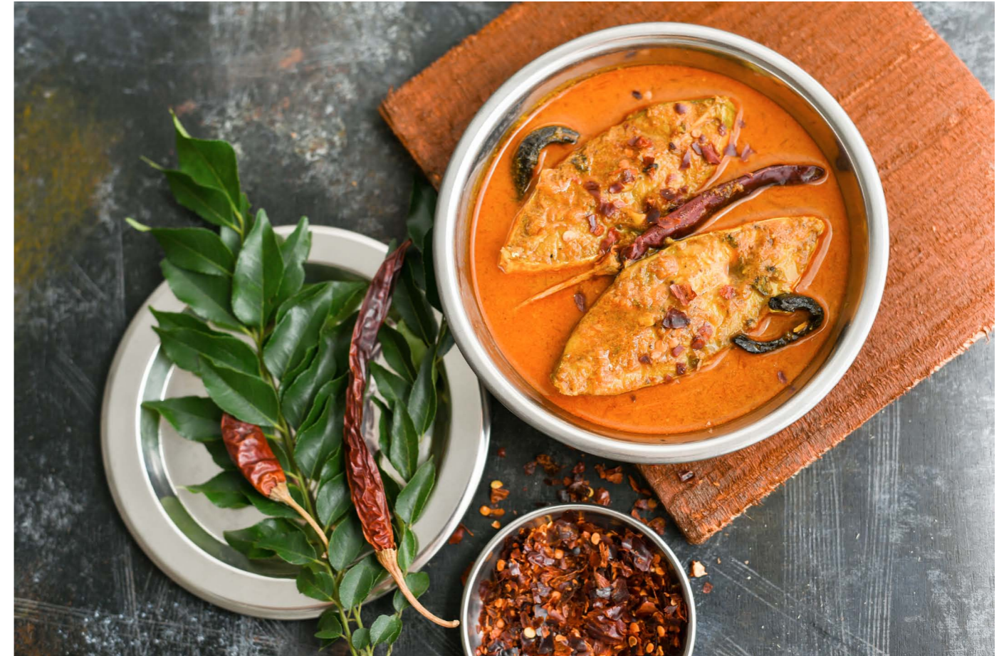
One of the main ingredients of the Malayali fish curry is the kudam puli or Malabar tamarind

Kudam puli or Malabar tamarind is a popular souring agent in South India and is often used as a substitute for the regular imli or tamarind. Its appearance