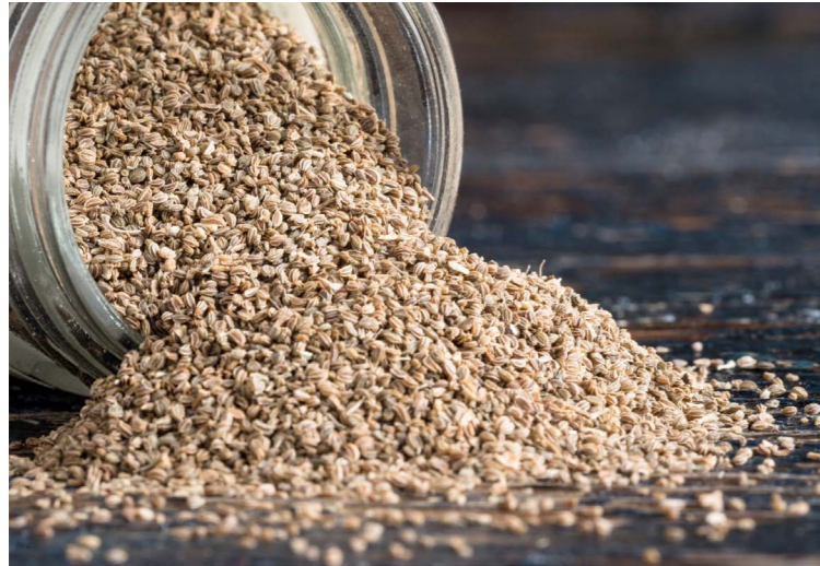
Top: Radhuni , a spice indigenous to West Bengal, has an aroma similar to parsley, tastes like celery and has a striking resemblance to carom seeds. It is used in the preparation of several dishes including daal (lentil soup)