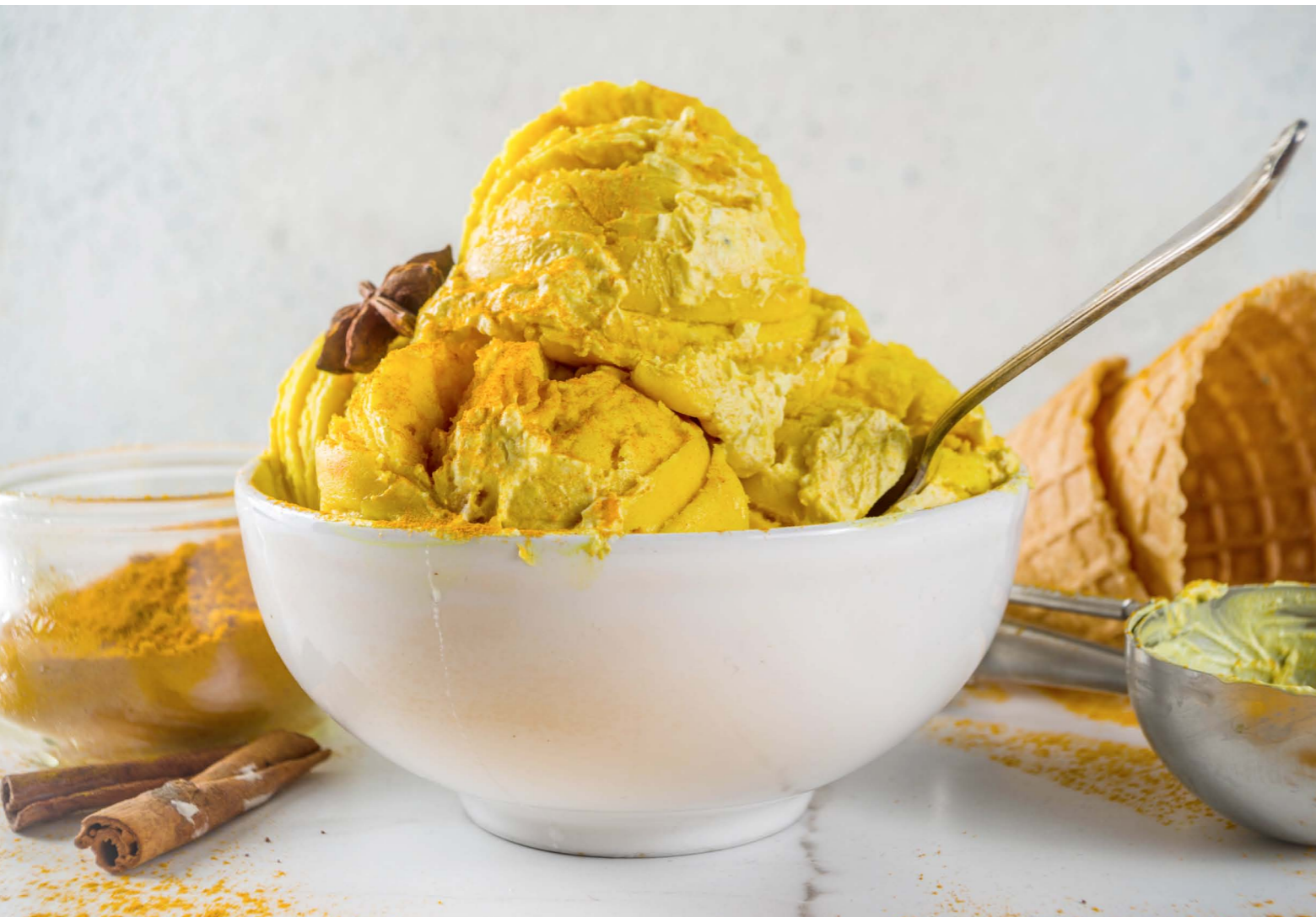
Of the many new-age recipes that incorporate the use of turmeric, vegan ice creams spiced with cinnamon are one of the most popular

Flavourful and aromatic with a host of health benefits - Indian spices are one of a kind. While some seasonings are popular, there are a few indigenous ones that are rarely used. Celebrity chef and Padma Shri awardee Sanjeev Kapoor explores a few of India's lesser-known spices