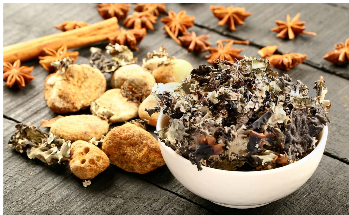
Bottom: Lichens, called kalpasi in Tamil, are important indicators of atmospheric purity and will not grow when the air is polluted. They require a slight elevation above sea level, which is why Ooty and Kodaikanal in Tamil Nadu are important catchment areas for the spice

This special yet rare spice, which aids digestion, reduces inflammation and acts as a pain reliever, is primarily used in Maharashtrian and Chettinad cuisine (of Tamil Nadu). The upper surface of this spice is dark green or black in colour. It has a strong earthy aroma and a dry texture, and is incorporated in the preparation of such popular indigenous spice mixes as Maharashtra's kala masala and goda masala , and Hyderabad's potli masala .