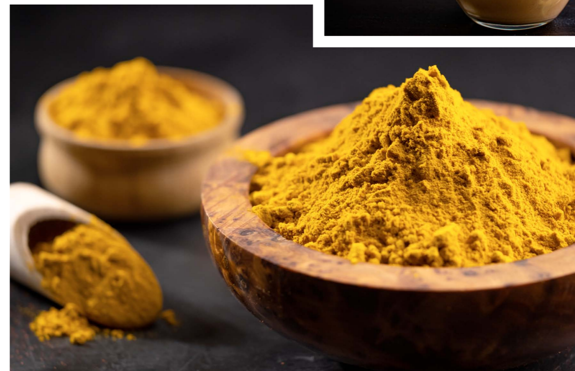
Top: Cinnamon turmeric ice tea is a refreshing and nutritious summer drink. Not only does it cool the body but also boosts immunity