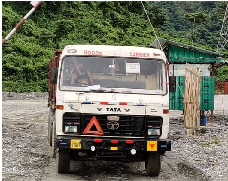
Image: The first truck containing goods from Bhutan crossing over into India through Ahllay, Pasakha on 19 August 2020.

Bhutan is India's closest partner and friend and India's response in record time is a reflection of the special bonds of trust and understanding between India and Bhutan that have existed over decades. Going forward, India will continue to extend all possible support to Bhutan to minimize the health and economic impact of the Covid-19 pandemic.