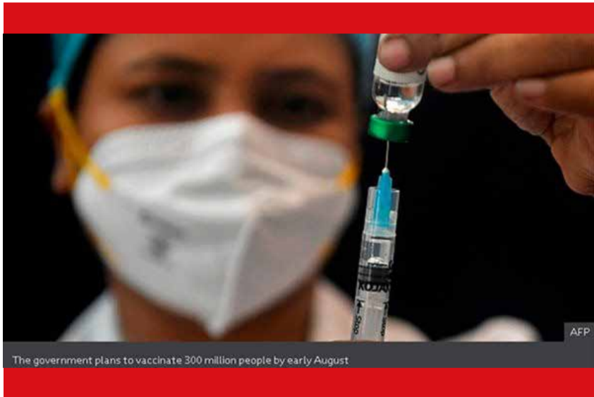
The government plans to vaccinate 300 million people by early August

India launches COVID vaccination drive India began the world's biggest vaccination drive today. Indian Prime Minister Narendra Modi launched the programme, which aims to vaccinate more than 1.3bn people against COVID-19. Covishield and Covaxin are the two approved vaccines.