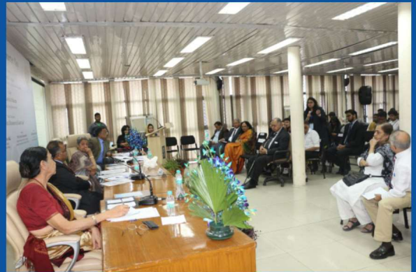
Faculty of Legal Studies