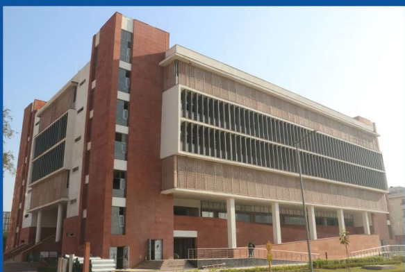
Faculty of Engineering and Technology