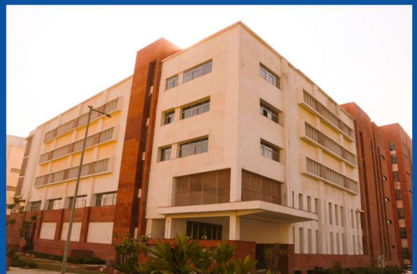
Faculty of Arts and Design