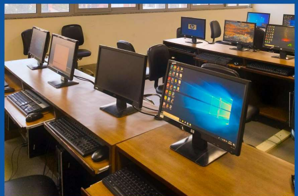
Faculty of Mathematical Sciences