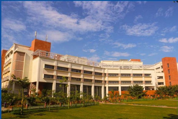
Faculty of Economics