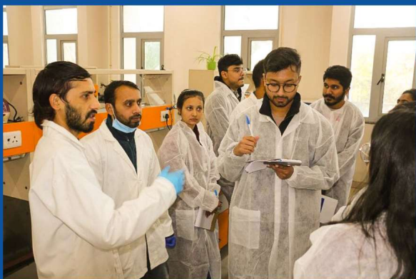
Faculty of Life Sciences and Biotechnology