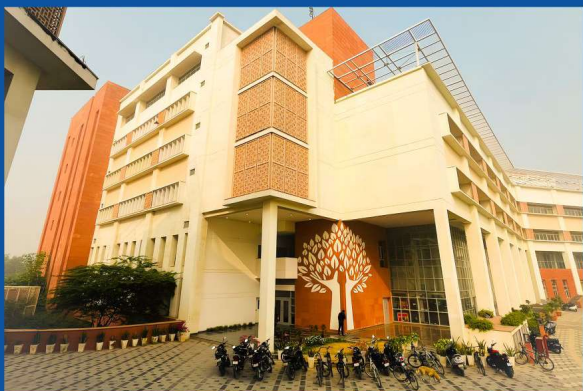
Faculty of Social Sciences